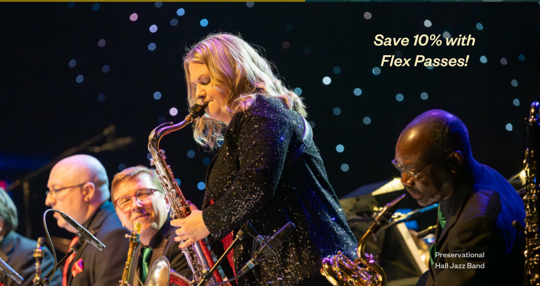
Preservational Hall Jazz Band