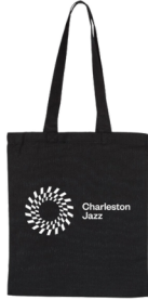
Tote Bags $15