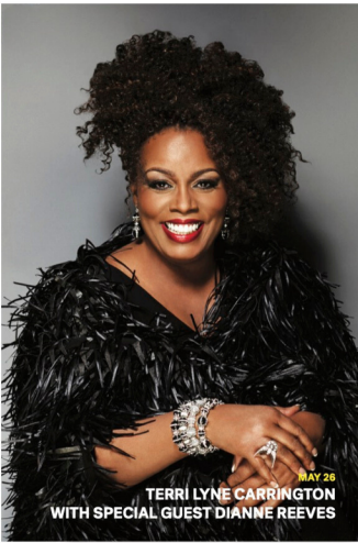
MAY 26 TERRI LYNE CARRINGTON WITH SPECIAL GUEST DIANNE REEVES