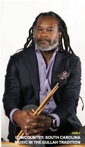
JUNE 2 LOWCOUNTRY: SOUTH CAROLINA MUSIC IN THE GULLAH TRADITION